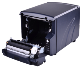
Frontal Paper Loading