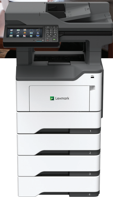
MX622adhe with optional trays