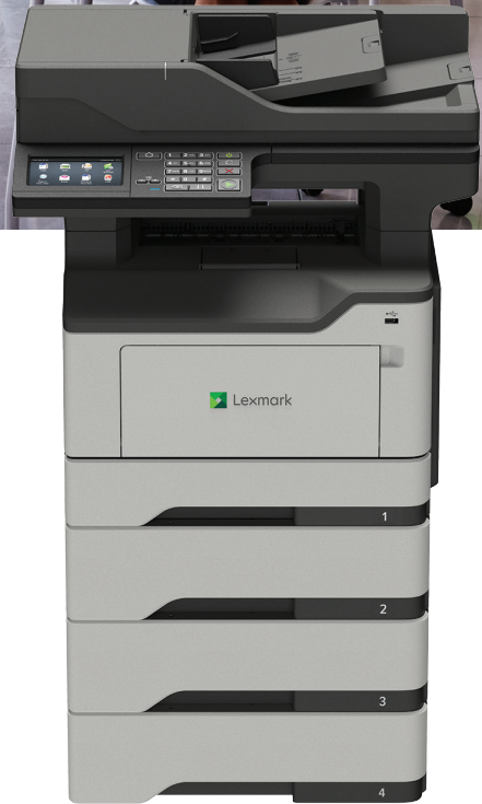
MX522adhe with optional trays