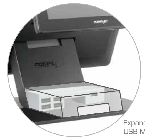
Expandable USB Module

Advanced cable management design delivers a truly clutter-free station. The standard base can house the optional PoweredUSB or USB extension module, while the optional base integrates a UPS backup (RB-5000) for the event of a power failure.