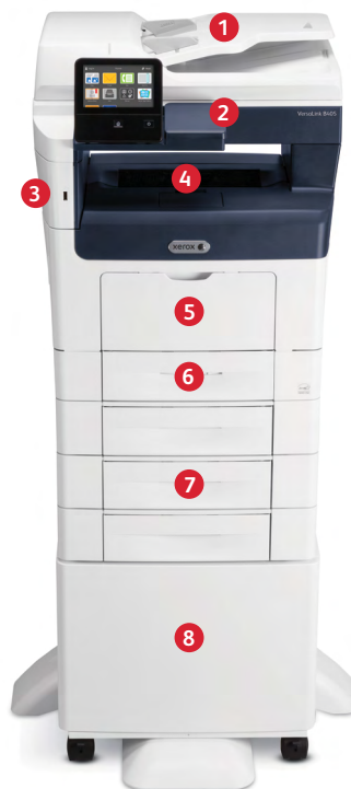
Xerox® VersaLink® B405 Multifunction Printer Print. Copy. Scan. Fax. Email.