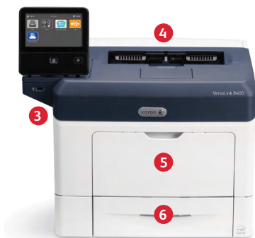
Xerox® VersaLink® B400 Printer Print.